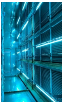
Air Handler Disinfection

Please contact Fresh-Aire UV to discuss your specific application: 1-800-741-1195 or email sales@FreshAirUV.com .