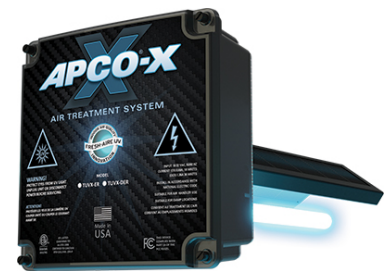
Fresh-Aire UV APCO-X whole-house air purifier

UV disinfection systems for HVAC are an ideal proactive measure to complement filtration. Microorganisms, particularly viruses, are so small that filters are mostly ineffective. The UV systems have also been shown to reduce problematic molds and pathogens that are found within the HVAC system and drain pan that would otherwise be introduced and distributed throughout the envelope of the building.