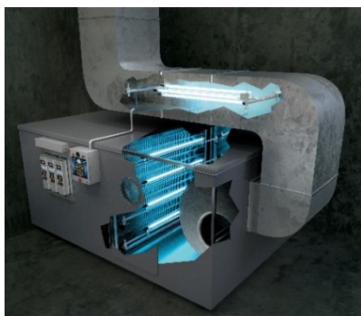
Air Handler & Airstream Disinfection