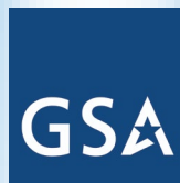
USGSA 2003 Facilities Standards for the Public Building Service, Chapter 5.9. Since 2000, in every GSA-funded new construction project, GSA requires UV light to be applied to all coils and drain pans of every HVAC system.