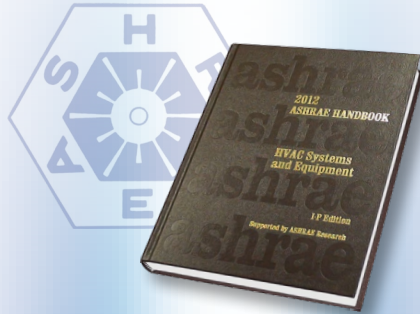
ASHRAE 2012 HVAC Handbook, Chapter 17, "Ultraviolet Air & Surface Treatment"

UV light technology has been recognized for its benefits and energy savings in the following industry and government handbooks: